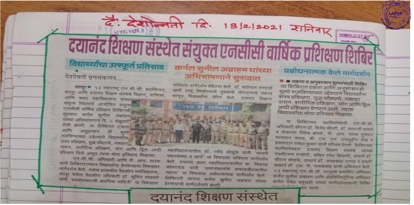
NEWS PAPER COVERAGE