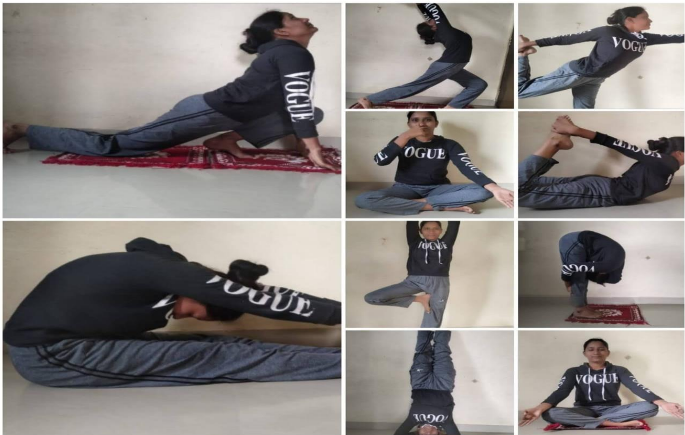
CADET PERFORMING YOGA AT HOME.