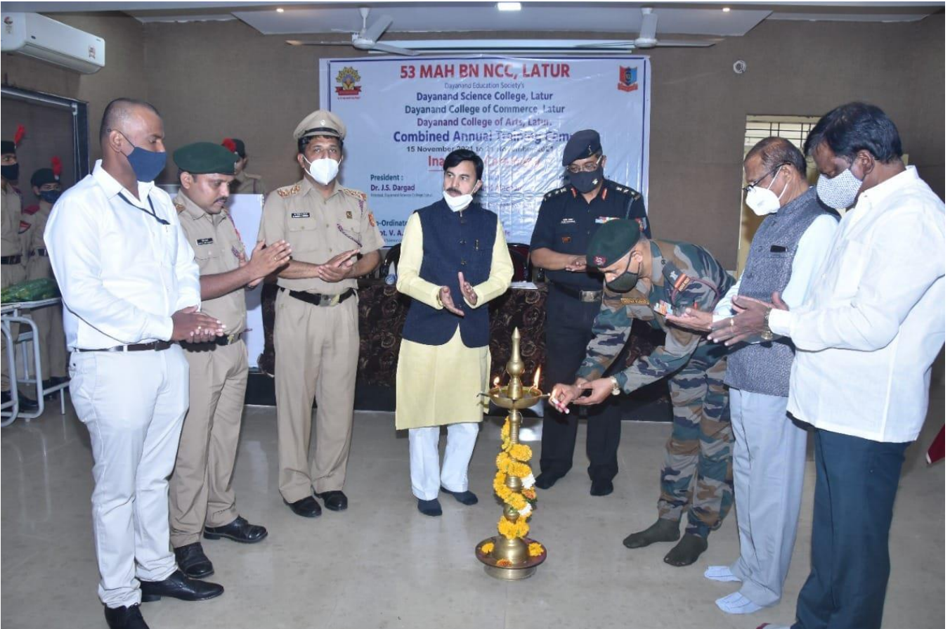
INAUGURATION FUNCTION OF CATC CAMP