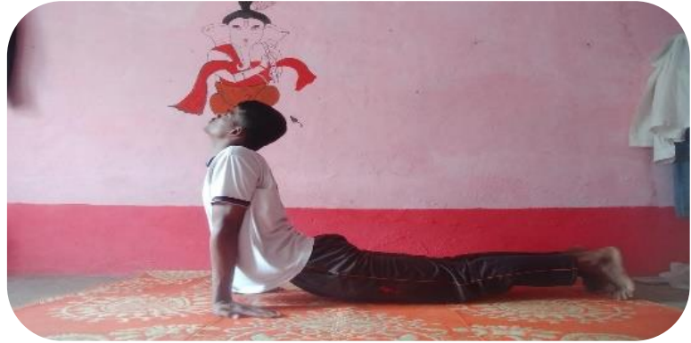
Cadet performing Yoga at Home.