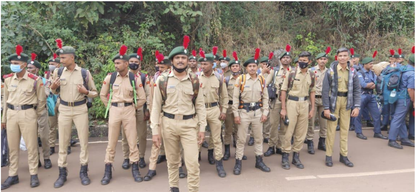
CADET LEADING MAHARASHTRA TROOP AT STT CAMP .