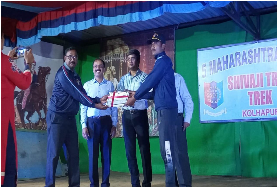
CADET RECEIVING CERTIFICATE AT NATIONAL CAMP.