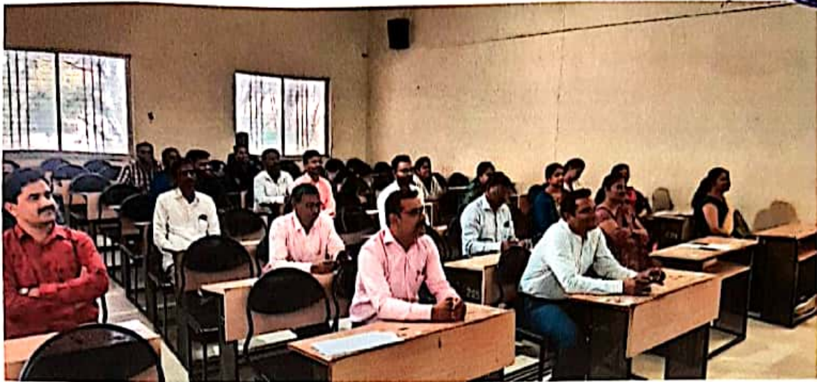
Faculty members learning use of ICT & Microsoft Teams during the Workshop