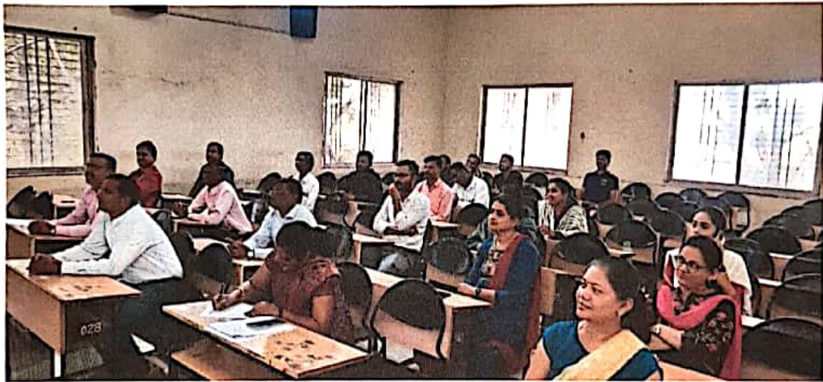
Faculty members learning use of ICT & Microsoft Teams during the Workshop