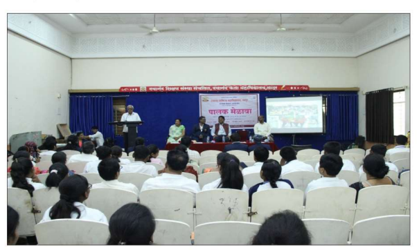
BCA Department arranged Parent Meeting on 09 October 2023