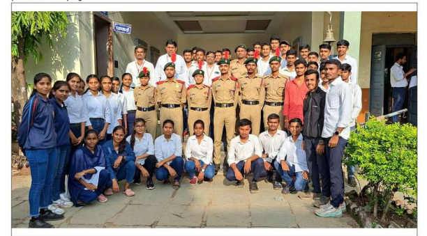
NCC Cadet Rank Ceremony 2023-24