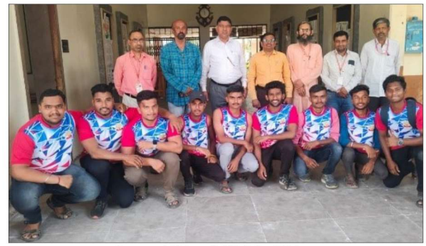
Power Lifting & Weight Lifting University Level Championship team