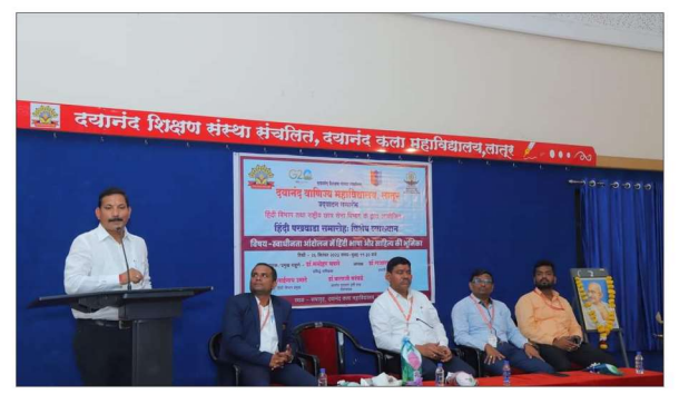
On the Occasion of 'Hindi Pakhwada Din' NCC Department organized Guest Lecture on 'Swadhinanta Andolan Mai Hindi Bhasha Aur Sahitya ki Bhumika'.