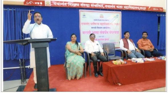
Marathi Department organised programme on ' Kavita Ranatlya' on the occasion of "Bhasha Sawardhan Pandharwada Din'.