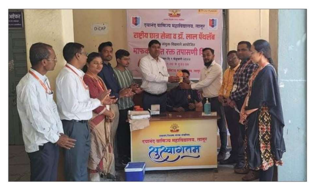
NCC Department of Daynand College of Commerce, Latur & Dr. Lal Path Lab Jointly organised free Blood Checkup Camp.