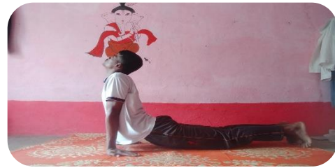
Cadet performing Yoga at Home