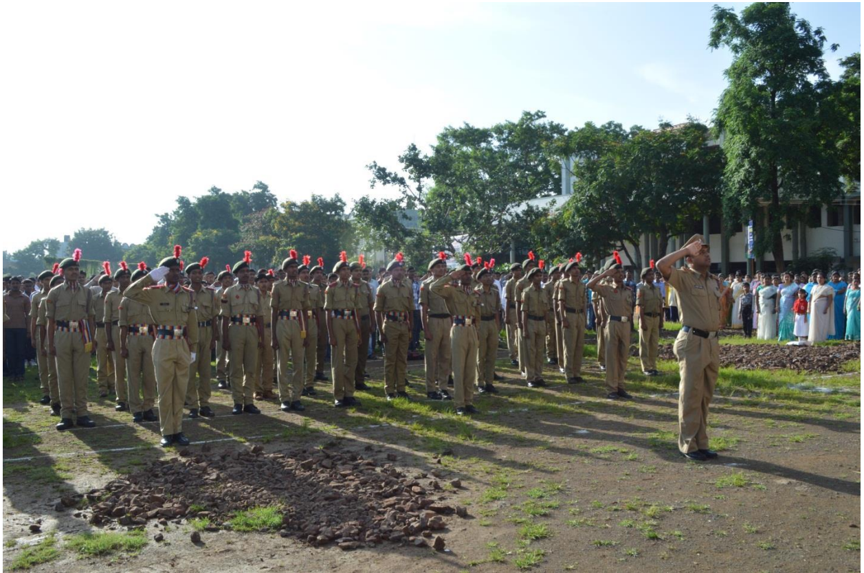
Figure 1 Independence Day Celebration.