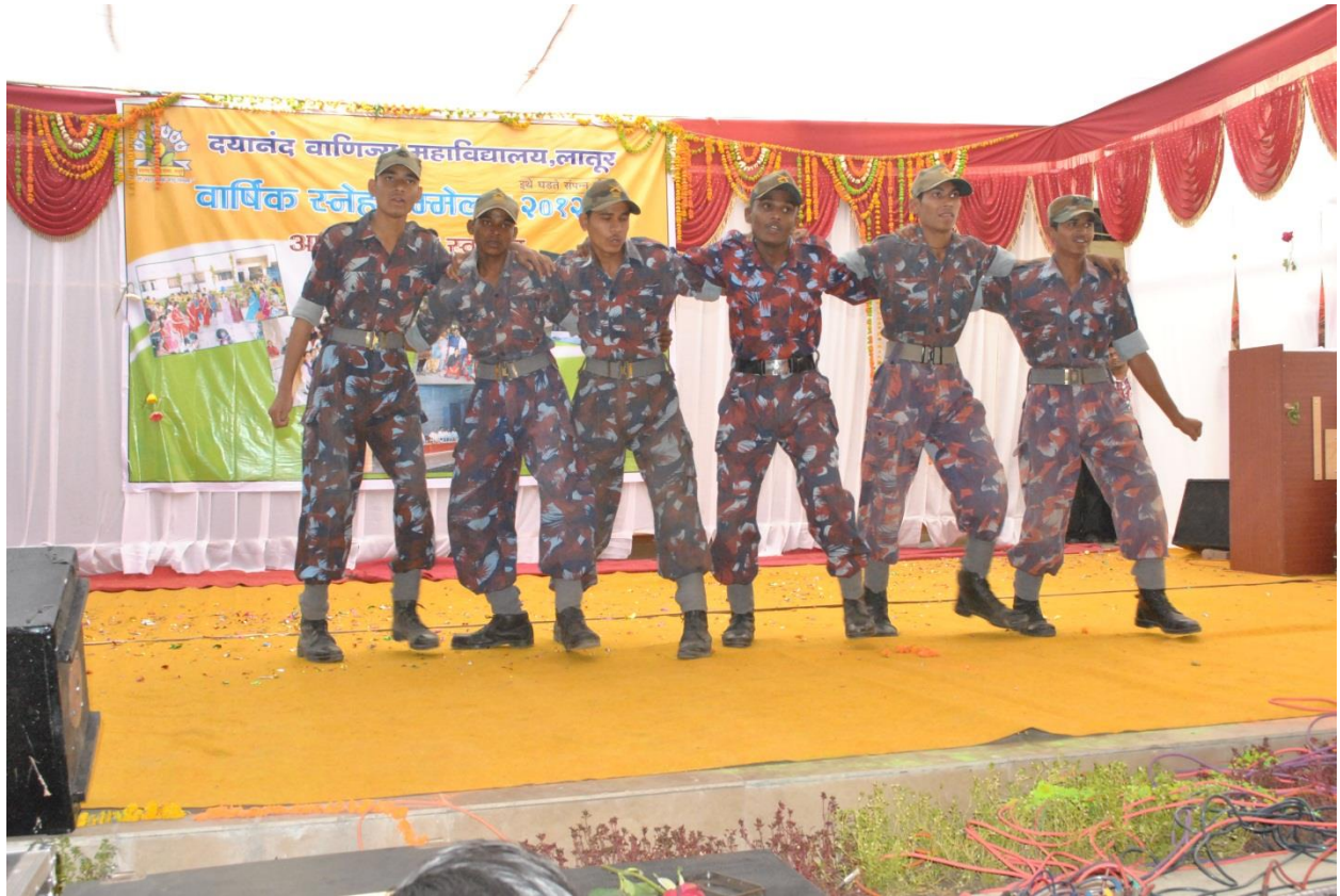
Figure 3 Cadets while performing in Annual Function