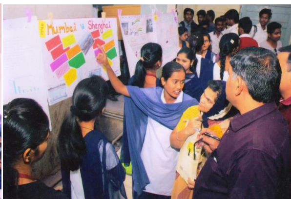
Business quiz round and poster presentation