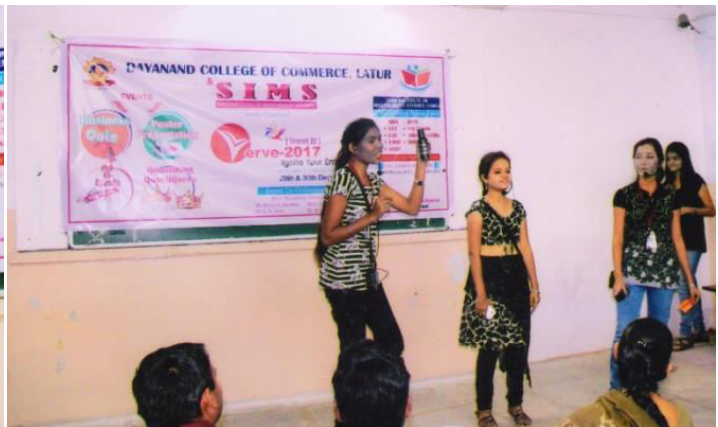
Students performing add on different products